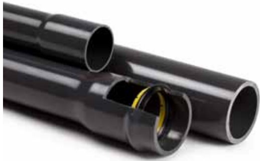
PVC pressure pipes