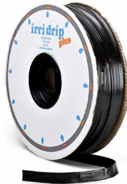
Irridrip - light dripping device