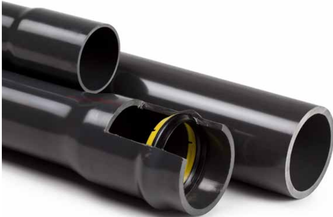
PVC pressure pipes for conveying water, irrigation and industrial applications.