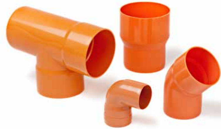
Fittings for constructions