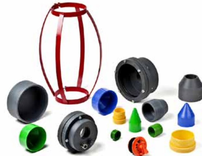
Fittings for artesian wells