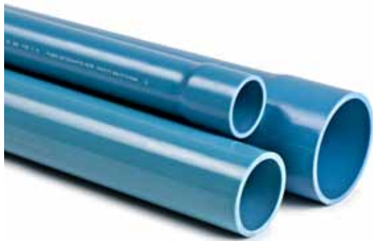
PVC artisan wells