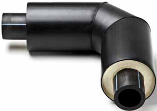
PVC and HDPE preinsulated fittings