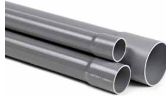
Flame-retardant PVC NFE NFME