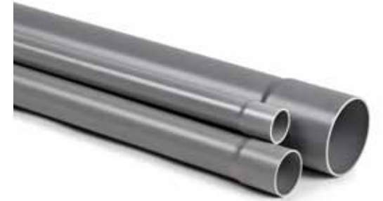
PVC telecommunication LST